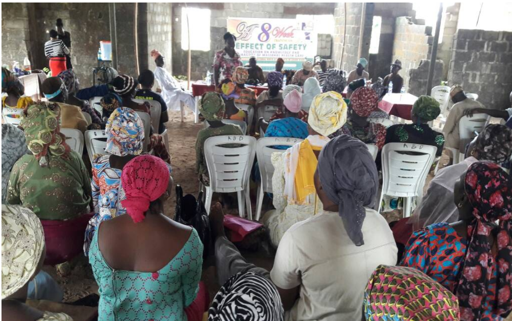
Researcher with a cross section of the participants in the experimental group during one of the sessions