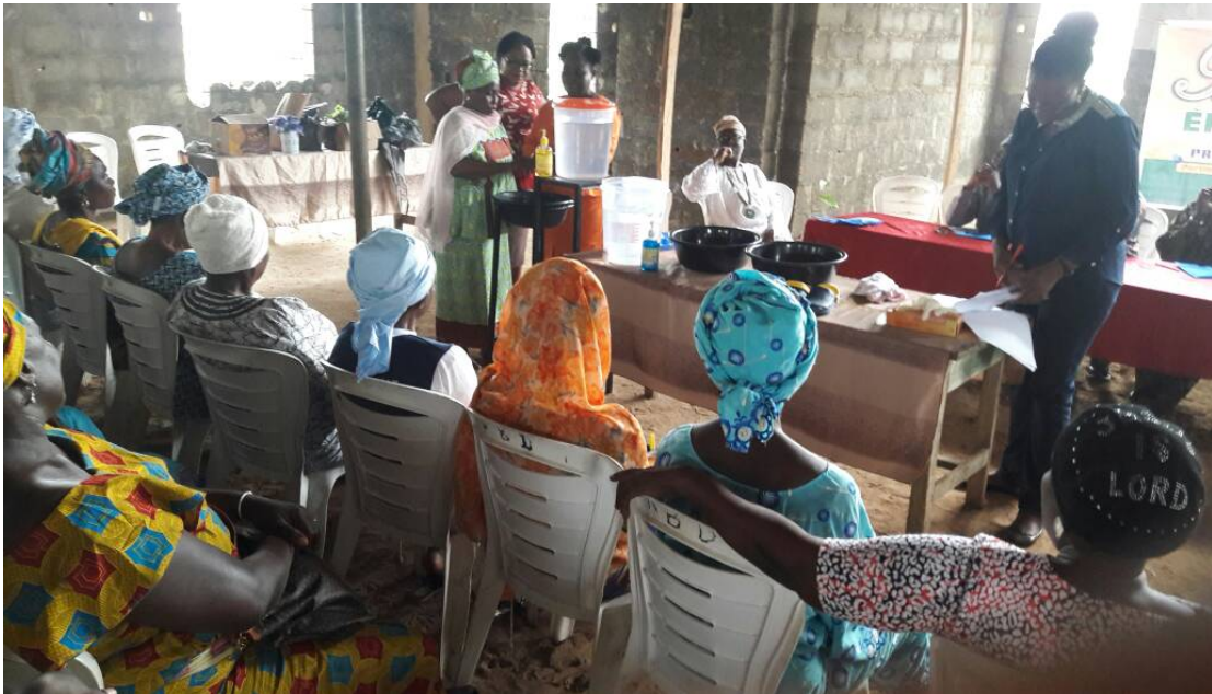
One of the participants demonstrating one of the safety skills with the supervision of the researcher and one of the research assistants