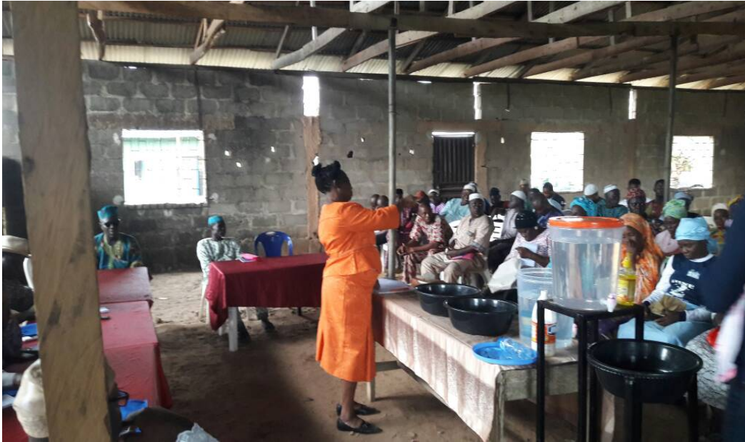
Researcher demonstrating one of the safety skills with a cross section of the participants in the experimental group