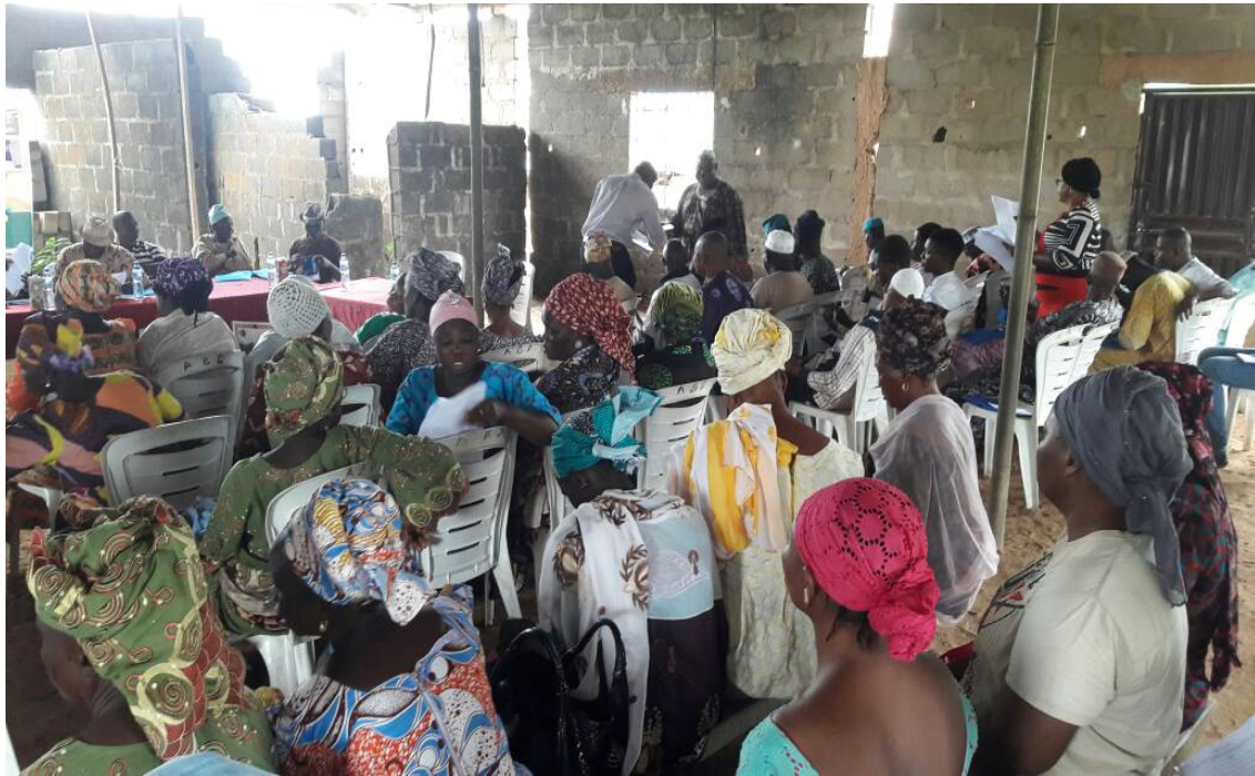
Cross section of the participants during administration of instrument