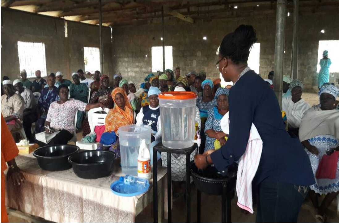
One of the research assistants demonstrating one of the safety skills with a cross section of the participants in the experimental group