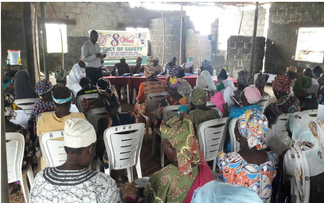
One of the research assistants with a cross section of the participants during administration of instrument