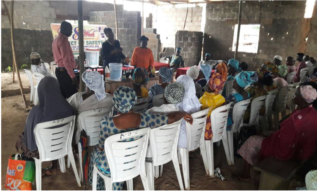
Researcher, two of the research assistants with a cross section of the participants in the experimental group during one of the sessions