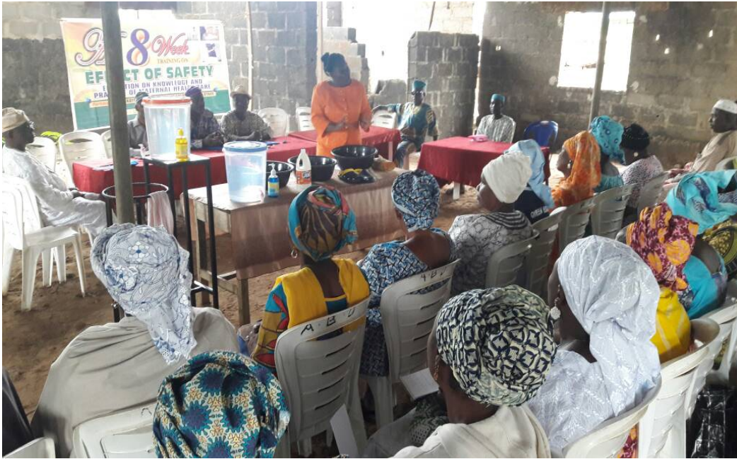
Researcher with a cross section of the participants in the experimental group during one of the sessions