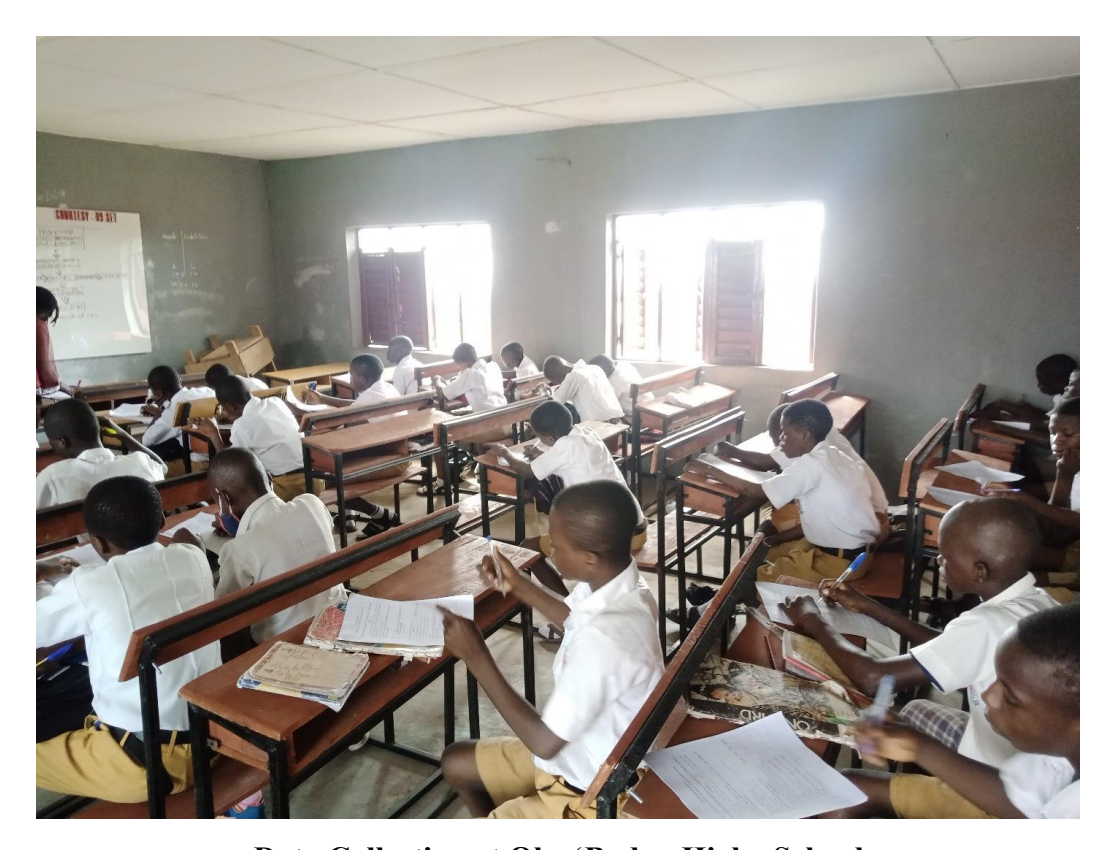
Data Collection at Oke 'Badan High School