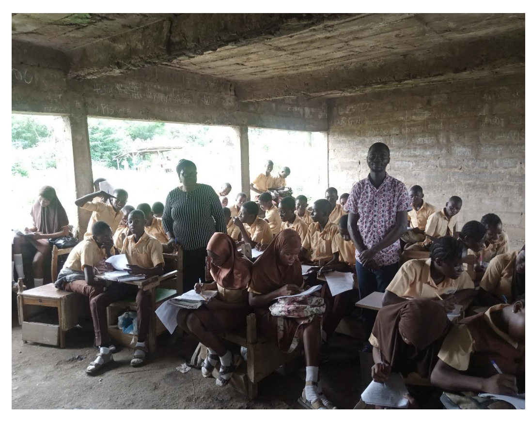
Data Collection at Oluyole Estate Grammar School