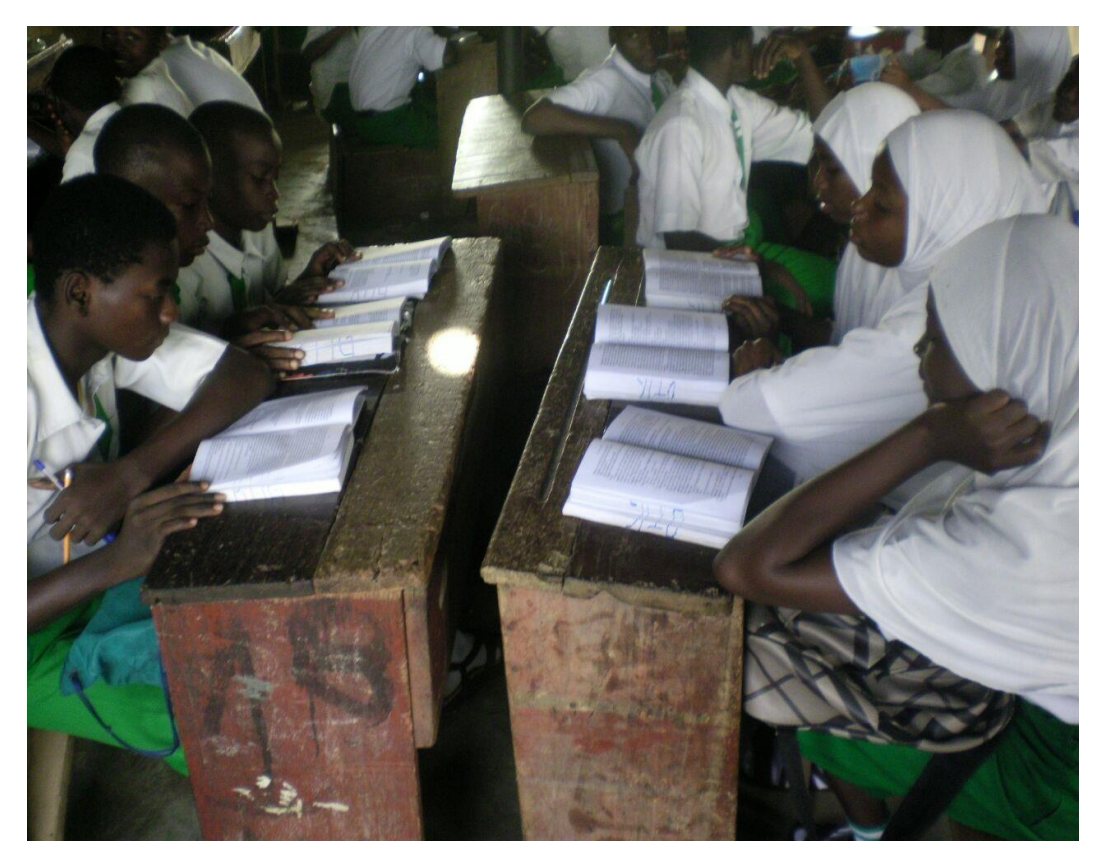
Students in Reading Club at Aperin Oniyere High School