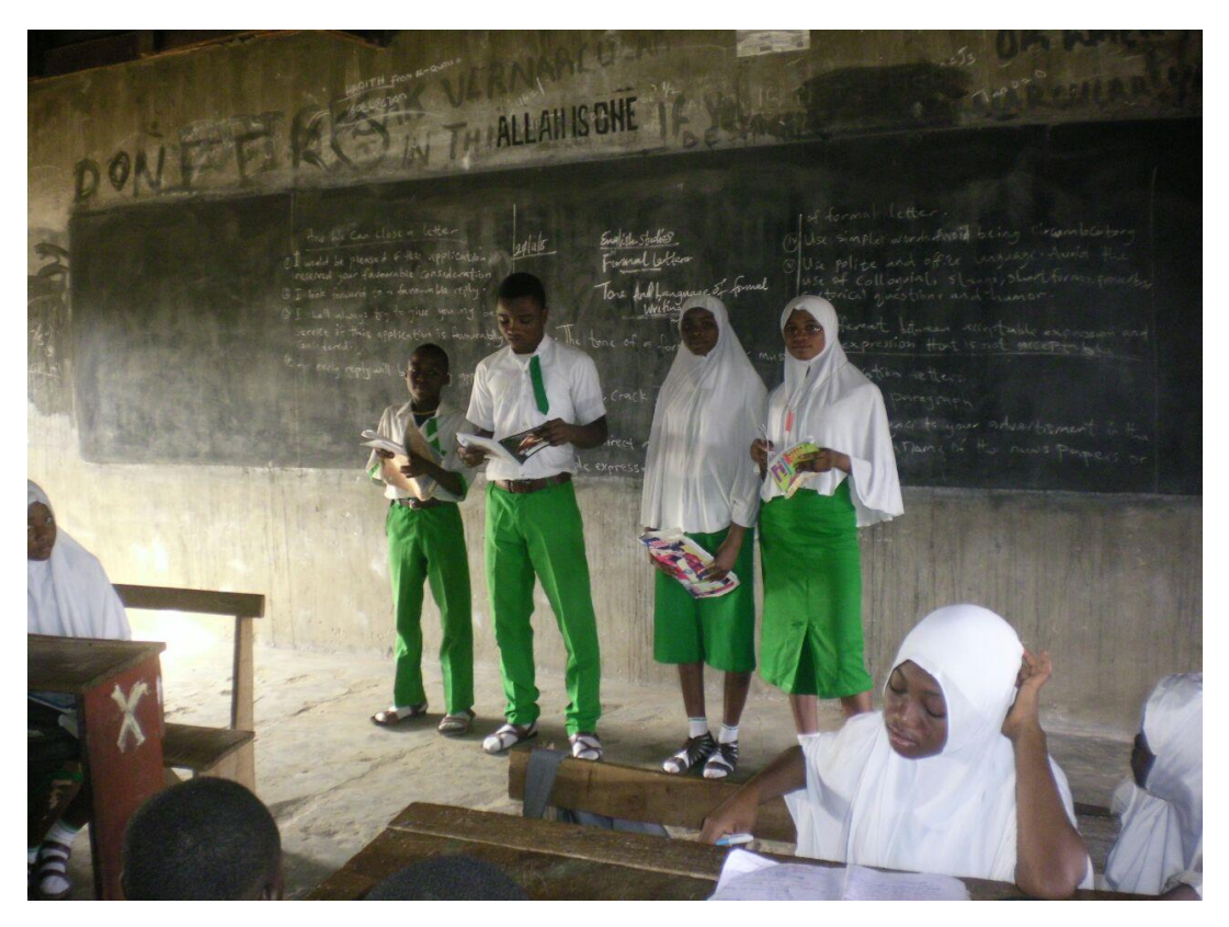
Reading Club Session at Mufu Lanihun Comprensive High School