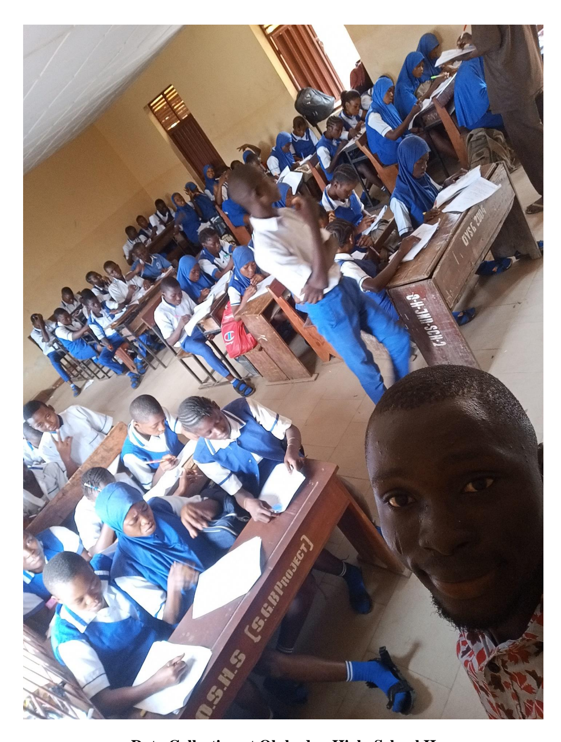
Data Collection at Olubadan High School II