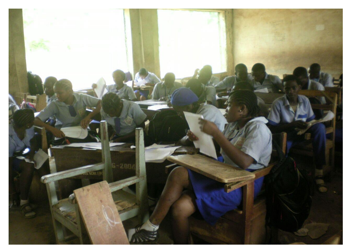
Students responding to questionnaires at Ibadan City Academy