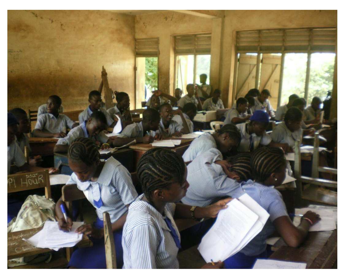
Administration of Instruments in Bashorun High School