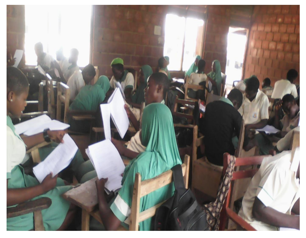
Students in Reading Club at Ansar-U-Deen High School