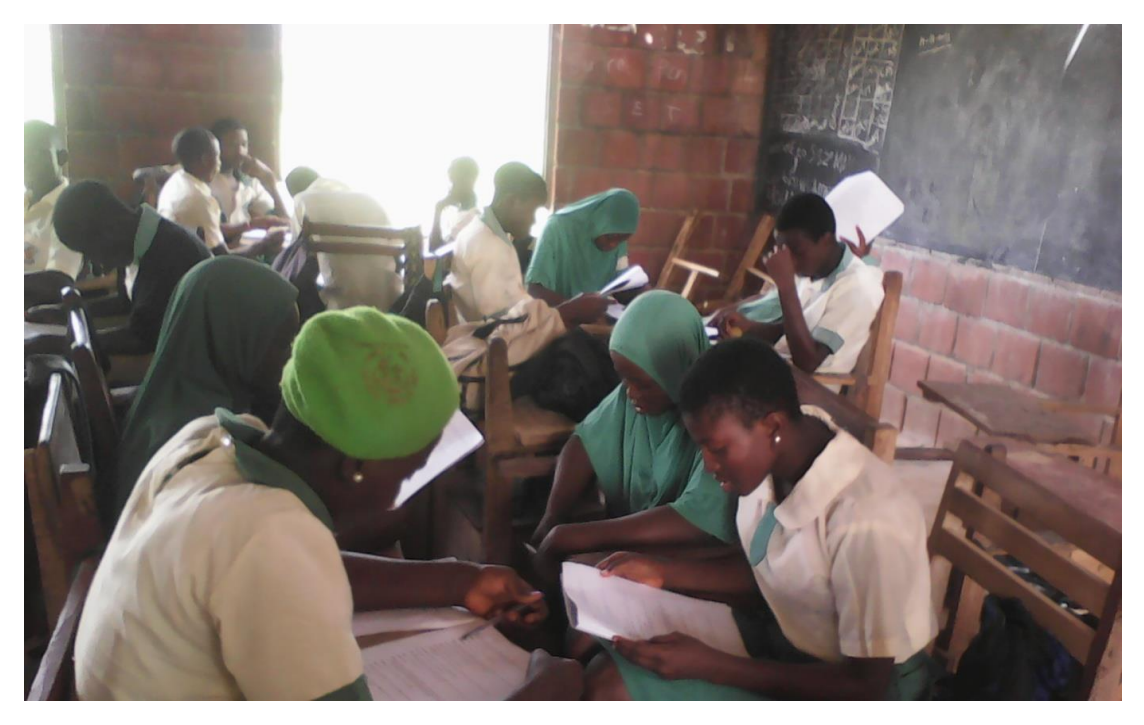
Students in Reading Club at Adelagun Memorial Grammar School