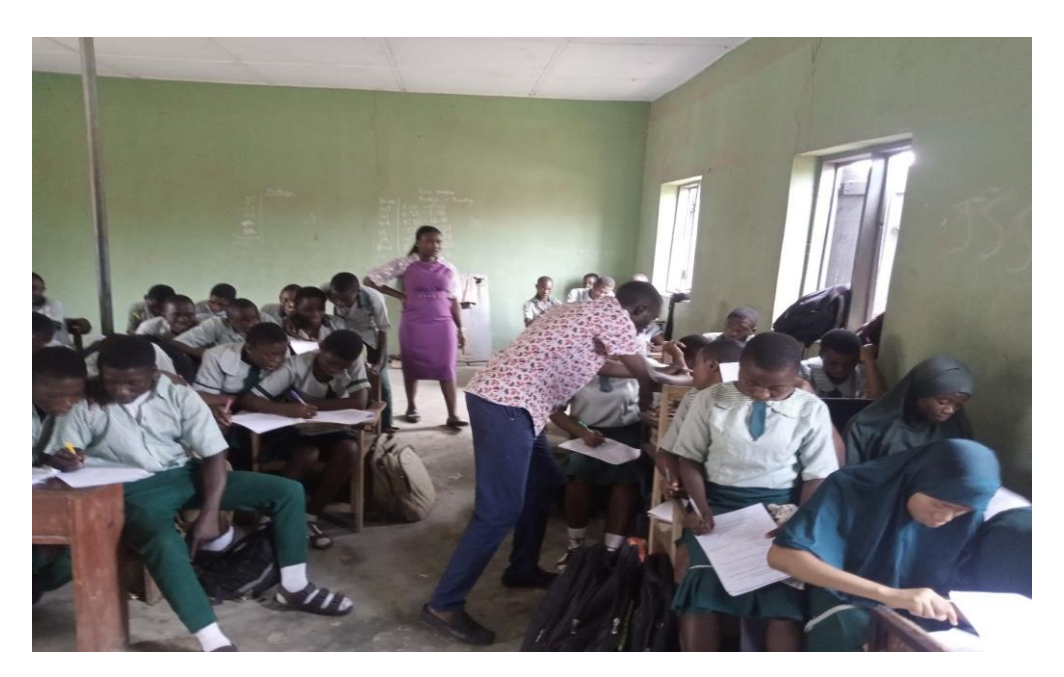
Data Collection at Oluyole Extension High School