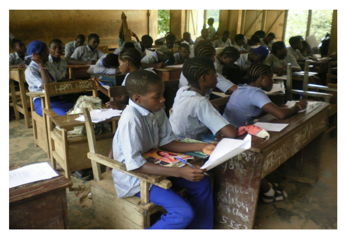
Data Collection at United Secondary School