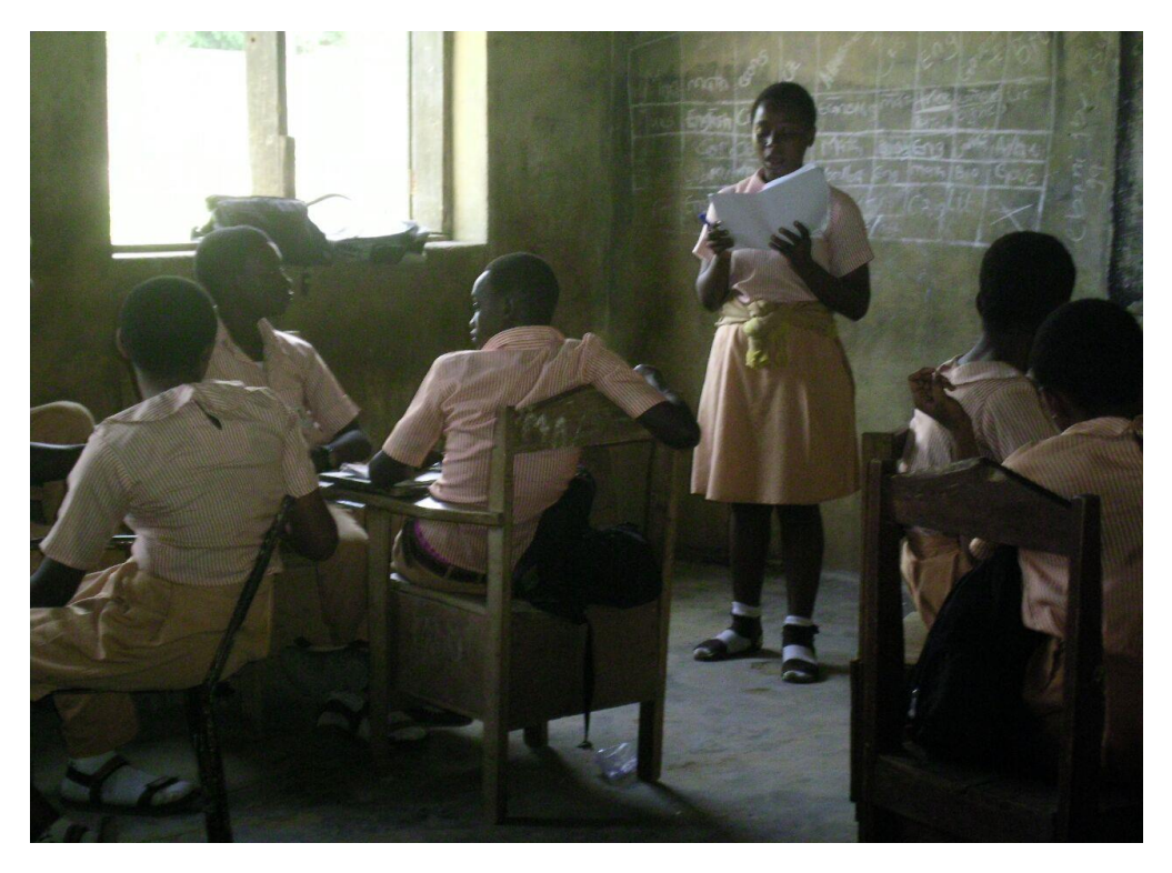
Students in Reading Club at Eleta High School