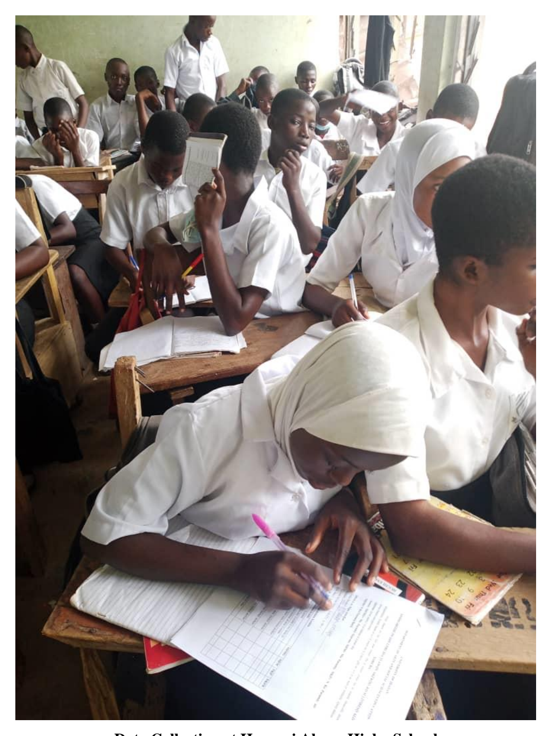
Data Collection at Humani Alaga High School