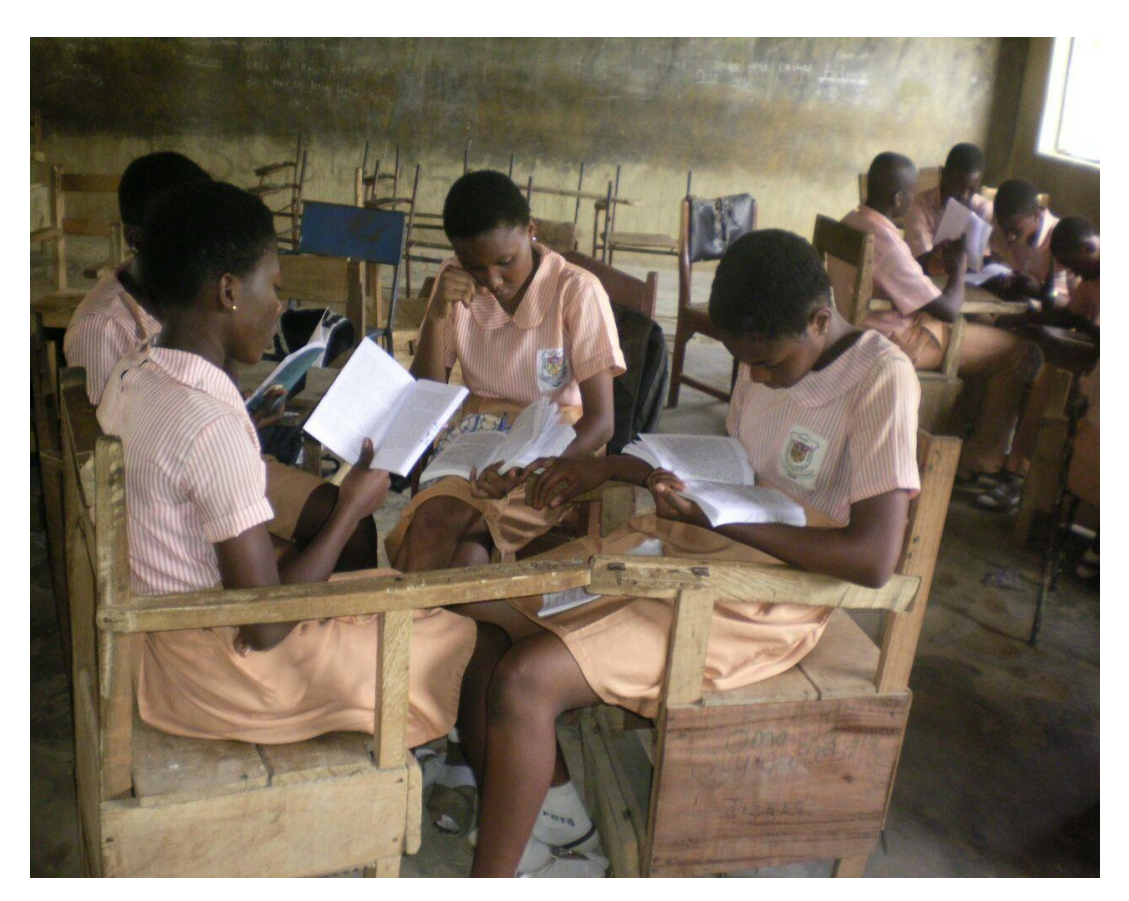
Students in Reading Club at Renascent High School